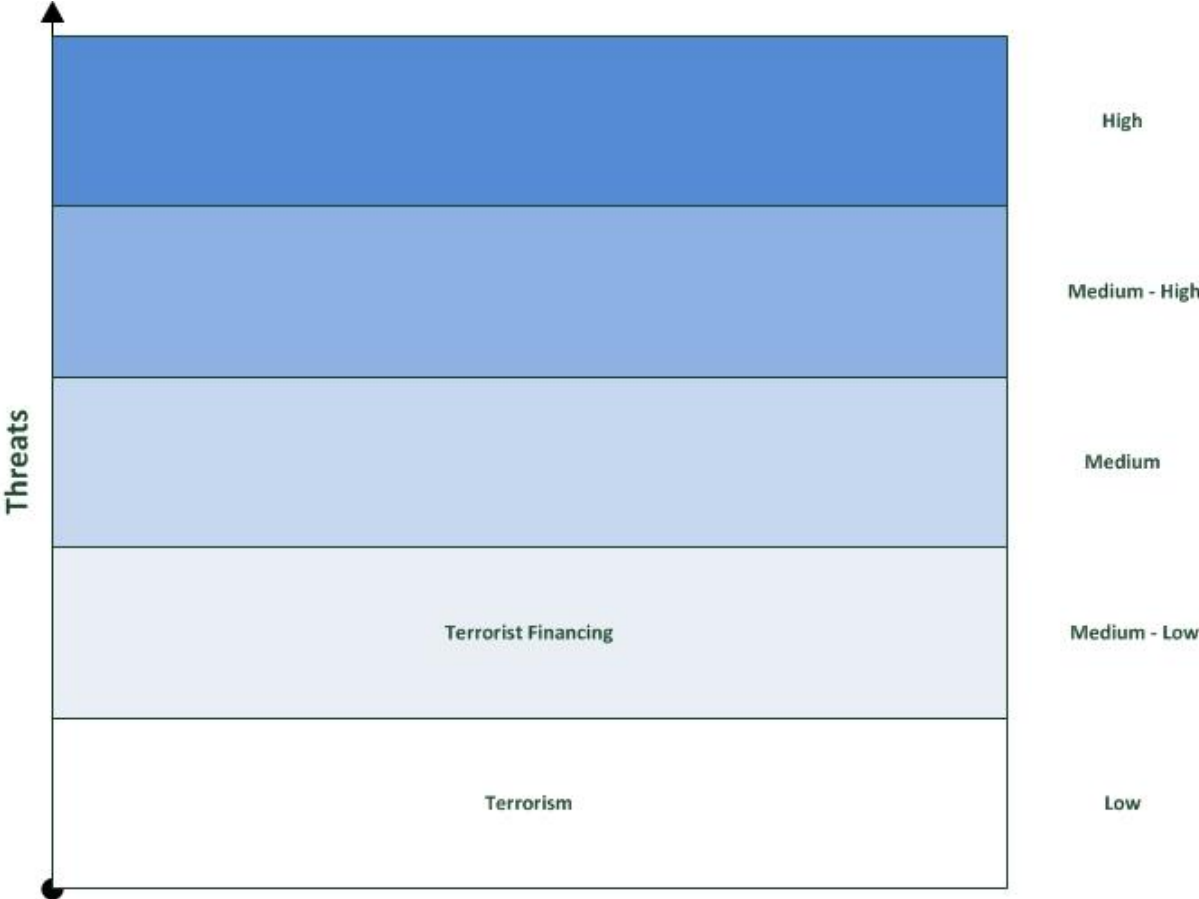
Figure 2: Threats relating to terrorism and terrorist financing

With regard to the threat relating to terrorism and terrorist financing, it should be emphasised that – even though attacks with a terrorist background took place in German-speaking countries and in neighbouring Europe during the period under review and in the months preceding the conclusion of this report – the threat situation continues to be low with regard to attacks planned in Liechtenstein.