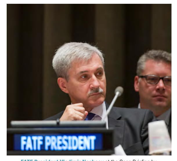
FATF President Vladimir Nechaev at the Open Briefing by the UN Security Council Sanctions Committees and the FATF, November 2013.

The FATF and the relevant bodies of the United Nations will continue to work closely to provide practical guidance on the implementation of targeted financial sanctions.